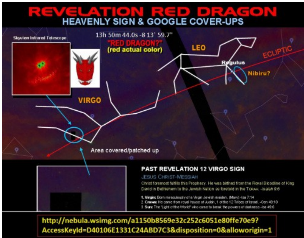
Nasa image of Red Dragon, blacked out by Google and Nasa.

Revelation declares there will be Meteors/Asteroids (Fire and Brimstone) falling from the Shamyim (Heavens) unto the Earth. Many believe this could very well be Planet X (Nibiru), which would enter earths atmospher Before November 2017. Jupiter's gravitational field controls numerous asteroids that are known as the Trojan asteroids. So the combination of Planet x passing through at this same time will reign down fire and brimstone upon the Earth